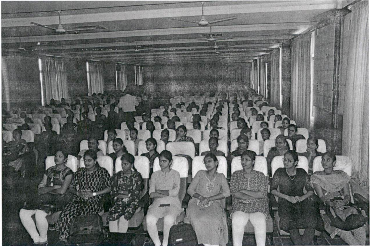
Interactive Session with BEC students on 20 February 2017

A handwritten signature in blue ink, appearing to read 'C. RaghavaRao'.