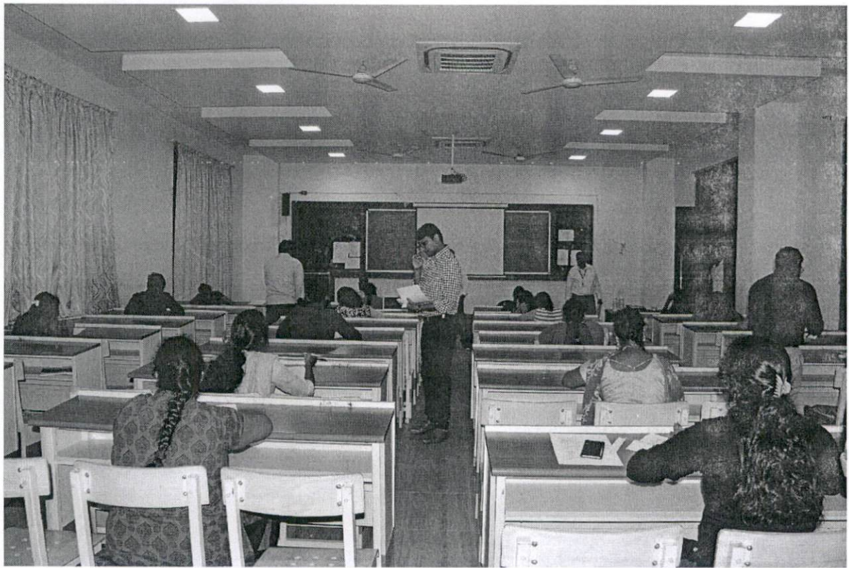
BEC Mock written examination on 9 September 2019